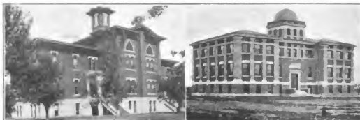
KANSAS WESLEYAN UNIVERSITY.